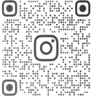
EZEKIEL YOUTH Ezekiel Youth Instagram Follow for updates and events.