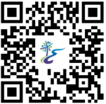
Ezekiel Lutheran Church General Fund https://www.ezeikiellutheran.org

Mon - Psalm 135 Tues - Acts 4:32-35 Wed - Psalm 133 Thurs - 1 John 1:1—2:2 Fri - John 20:19-31